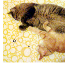
Figure 2: MFM images of the bi-component Py/Co dots for different values of the applied magnetic field which are indicated by greek letters along both the major and minor hysteresis loop.

To directly visualize the evolution of the magnetization in the Py and Co subunits of our bi-component dots during the reversal process, we performed a field-dependent MFM analysis whose main results are reported in Fig. 2. At large positive field ( H = +800 Oe, not shown here) and at remanence ( \alpha point of the hysteresis loop of Fig. 1), the structures are characterized by a strong dipolar contrast due to the stray fields emanated from both the Py and Co dots.