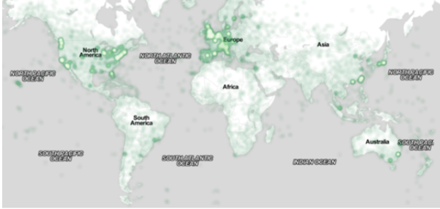
Figure 4: Calculated spatial distribution of the in-plane dynamic magnetization.

They exhibit marked localization into either the Co or the Py dots, as stated at the end of the previous Section, were it was introduced the labelling notation containing the dominant localization region (either Py or Co) and the spatial symmetry (EM, F, DE, etc).