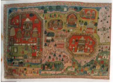
Figure 6: Calculated frequency evolution of modes detected in the BLS spectra.

In Fig. 6 the calculated frequencies of the most representative eigenmodes at +500 Oe (FM state) and − 500 Oe (AP state) are plotted as a function of the gap size d between the Py and Co sub units (please remind that in the real sample studied here, d = 35 nm). As a general comment, it can be seen that the frequencies for the system in the AP state are more sensitive to d than those of the P state. In particular, the lowest three frequency modes of the AP state (EM(Co), EM(Py) and F(Py)) are downshifted with respect to the case of isolated elements (dotted lines) and show a marked decrease with reducing d , while the two modes at higher frequencies (F(Co) and 1DE(Py)) have an opposite behavior even though they exhibit a reduced amplitude. In the P state (right panel), the modes concentrated into the Py dots exhibit a moderate decrease with reducing d , while an opposite but less pronounced behavior is exhibited by the F(Co) mode.